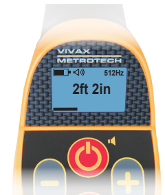
Push button depth reading