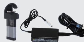
VM series Li-ion Rechargeable Transmitter Battery Kit