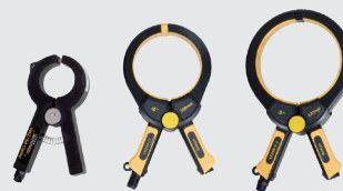
2", 4", and 5" Induction Clamps