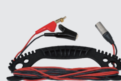
Telco Clip Direct Connection Lead