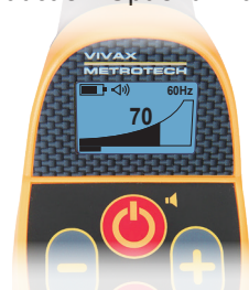
Peak locate response with accompanying audio tone

One induction, three direct connect and a fault find frequency