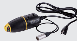
Live Plug Connector