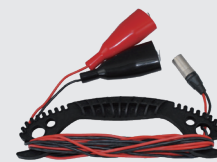
Heavy Duty Clip Direct Connection Lead