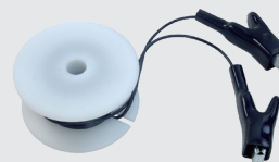
Ground Extension Spool