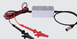
Live Cable Connector