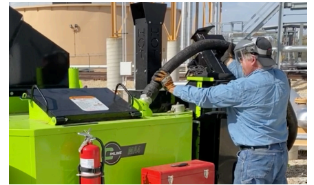
Bulk Material Loading Port