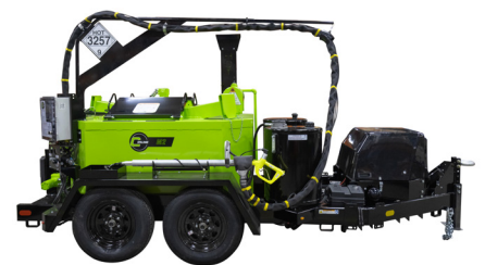
M-Series 150, 230 & 410 Gallon Crack Sealer Melter Applicator