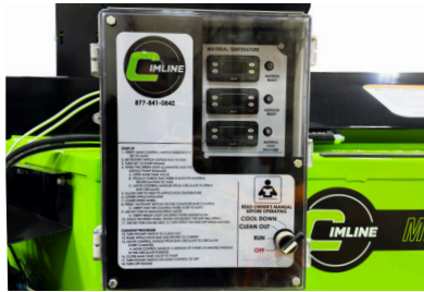
Melter Control Panel