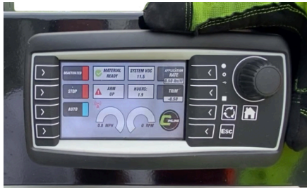
Application Rate Control Unit