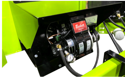
400,000 BTU Diesel Tank Burner