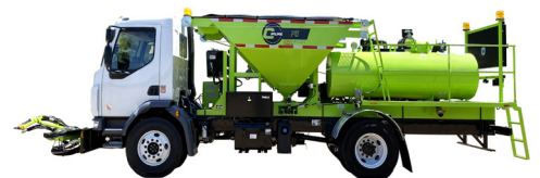
P5 One-Person Patcher with DuraPatcher™ Technology