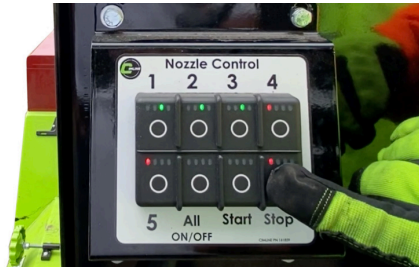
Spray Nozzle Control Panel