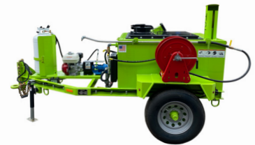
K-Series 250 or 500 Gallon Tack Application Trailer